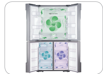
Triple Cooling System